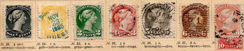
№ 16. 1/2 cent schwarz—black—noir. № 24. 1 c. gelb—yellow—jaune. grün—green—vert. № 25. 2 c. rot—red—rouge. № 26. 3 c. bronzegrün—olive. № 30. 5 c. braun—brown—brun. № 27. 6 c. № 28. 10 c.