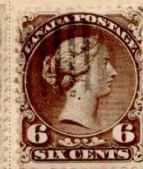
Nr. 22. 6 c. braun—brown—brun.