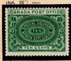
Nr. 1. 10 cents grün—green—vert.

Eilbriefmarke. Special-delivery. Pour lettress-express.