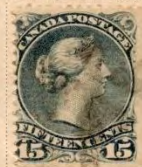
Nr. 25. 15 c. grau—grey—gris.