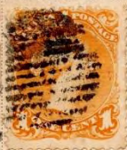
Nr. 18. 1 c. orange.