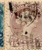
Nr. 24. 15 c. violett—violet.