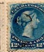
Nr. 23. 12 1/2 c. blau—blue—bleu.