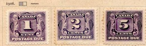
Nr. 1. 1 cent violett—violet.

Nachportomarken. Unpaid letter stamps. Timbres-taxe.