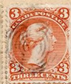
Nr. 20. 3 c. braun—brown—brun.