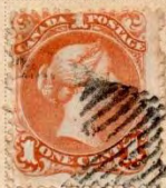
Nr. 17. 1 cent. orange.