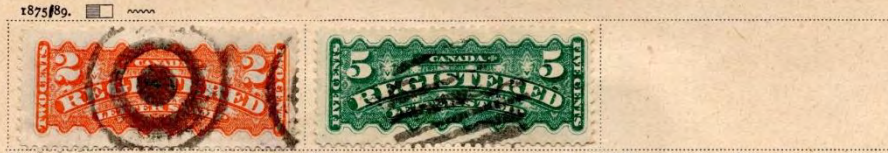
Nr. 1. 2 cents rot—red—rouge.

Einschreibebriefmarken. Registered letter stamps. Timbres pour lettres enregistrées.