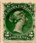
Nr. 19. 2 c. grün—green—vert.