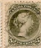
Nr. 21. 5 c. grün—green—vert.