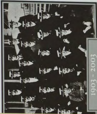
1903 - 2003 100 Years of New Zealand Test Rugby