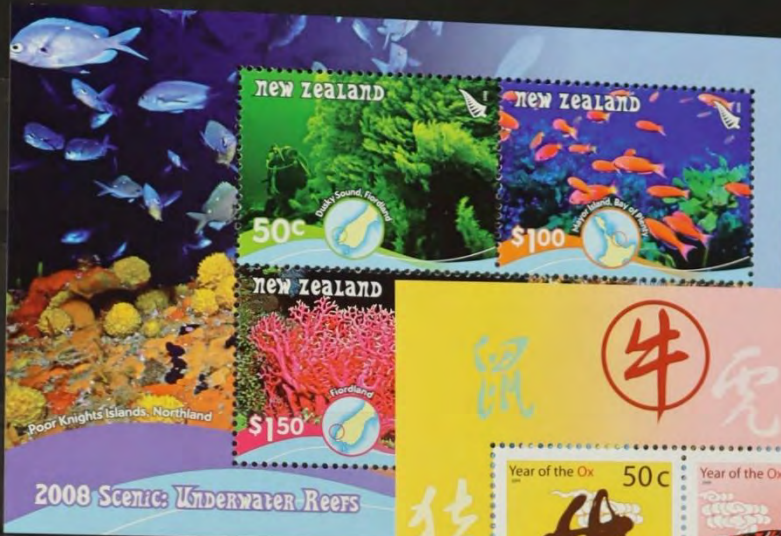
2008 Scenic: Underwater Reefs